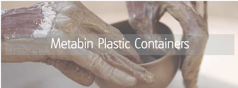
Metabin Plastic Containers